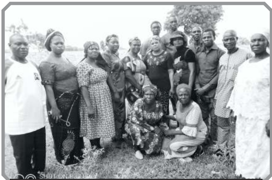
STAFF OF CELL SYSTEM