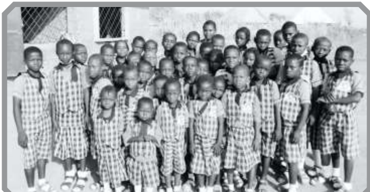
NURSERY & PRIMARY SCHOOL