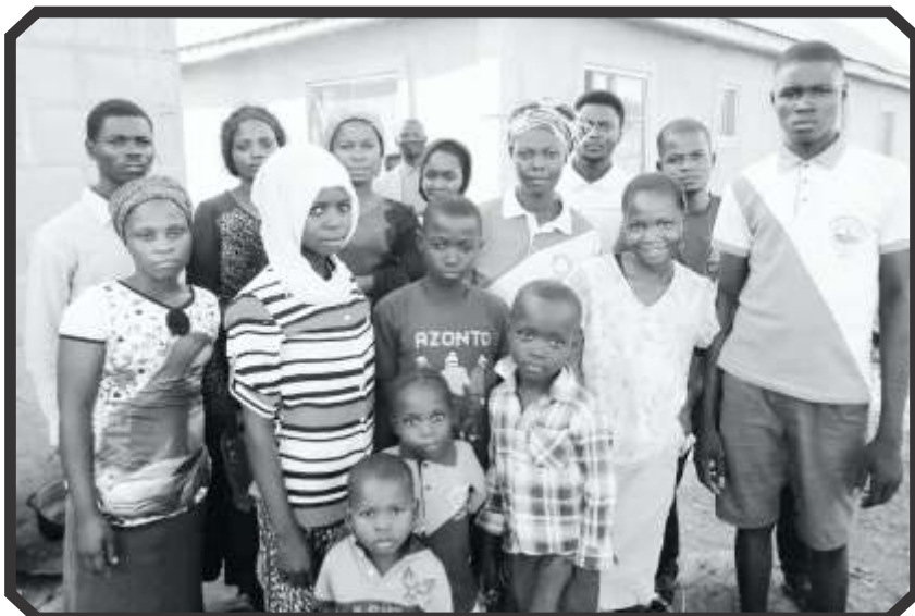
HOUSE CELL MINISTRY