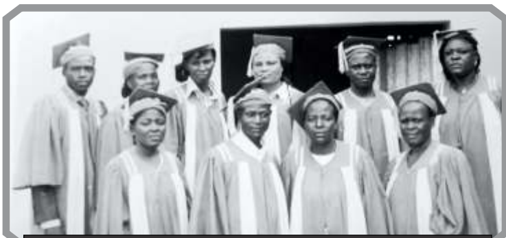
FIRST MATRICULATING BIBLE SCHOOL STUDENTS